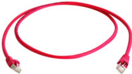
Fig. may differ

Patch Cord Cat.6 A MP8 FS 500 LSZH-5,0 m, red