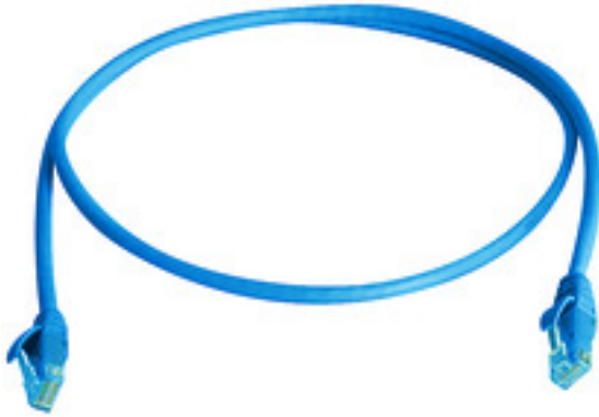
Fig. may differ

Patch cable U/UTP Cat.6, 5,0 m blue RAL 5015, LSZH