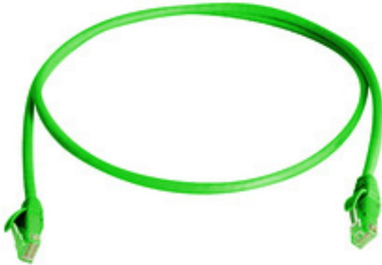
Fig. may differ

Patch cable U/UTP Cat.6, 5,0 m green RAL 6024, LSZH