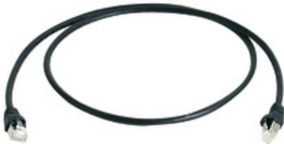
Fig. may differ

Patch Cord Cat.6 A MP8 FS 500 LSZH-3,0 m, black